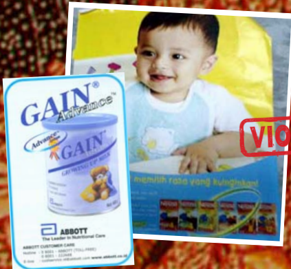
Advertisements from Abbott and Nestlé