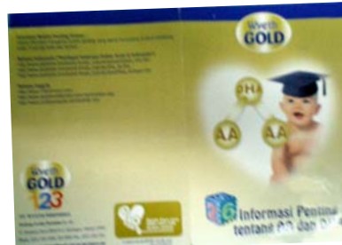
Products bearing the same names as infant and follow-up formulas inculcate brand loyalty