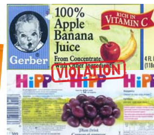
Both Gerber and Hipp fail to label their products in Bahasa Indonesia. Gerber does not indicate any precise age while Hipp labels its products as suitable from 12 weeks