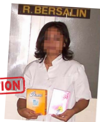
When health workers give out samples, they influence mothers to bottle feed

Companies are also aggressively seducing health workers because they know that doctors and nurses influence mothers' choices. Presents such as ice boxes, televisions and emergency lights have been donated to healthcare facilities while companies are also reported to give cash or 'cheap' and low-cost supplies of breastmilk substitutes to hospitals. Ready availability has a crucial impact on mothers and pregnant women, inducing them either to abandon breastfeeding or to supplement from a very early age. Nearly all healthcare facilities regularly receive free samples or bulk supplies of infant formula. Products such as SGM I and Vitalac I (Sari Husada), Lactogen I (Nestlé), Bebelac I (Nutricia) and Frisian Flag I (Friesland) are regularly distributed, in violation of the Code and to the detriment of mother and infant health.