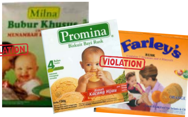
Pictures of babies on labels idealise the use of complementary foods for babies 4 months old