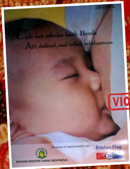
Using breastfeeding to promote Frisian Flag products with endorsement from the Pediatric Association