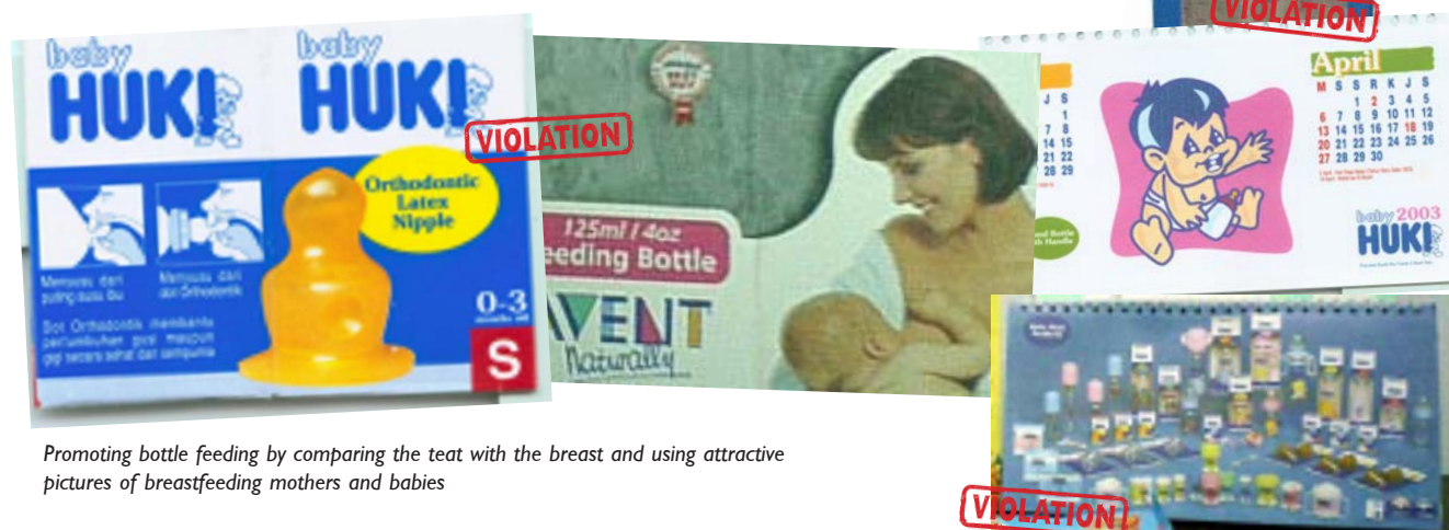
Promoting bottle feeding by comparing the teat with the breast and using attractive pictures of breastfeeding mothers and babies

Although bottles and teats are covered by Indonesian regulations, the focus to date has been on baby food companies, leaving bottle and teat companies free to promote their products in ways which are worse than the marketing practices of baby food companies. This is evident from the labelling of these products. Almost all brands found in Indonesia have pictures of mothers and babies or babies alone. They also make favourable comparisons with the breast (Avent and HUKI). Bottles and teats are promoted in the mass media (Chicco, Pigeon and HUKI), in shops (Chicco, Tommy Tippee, Japlo, Nuk, and Pigeon) and in health care facilities (Camera and HUKI)