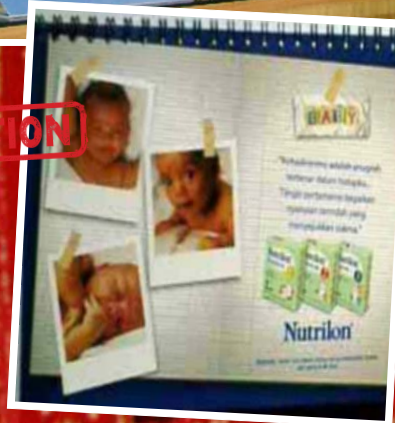
Gifts of calendars to health workers promote products and companies