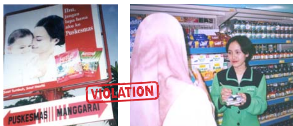
Two types of promotions to the public: road signs and company representatives in shops

Companies are also active in promoting product and company names through advertising. Billboards, television adverts, newspaper promotions and company-paid clinic signs are some of the ways used by companies to reach the public, in breach of Article 5 of the Code.