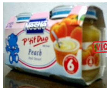
The outer packaging says "6 months" but conceals products which are labelled for 4 months

Labelling has always been a source of misinformation. In Indonesia, this is no different. Monitors found labels with the wrong age recommendation as well as labels which idealise, labels which omit required information, labels which make favourable comparison to breastmilk and labels which make unjustified claims. Several product labels are also not in the local language, but in English or French.