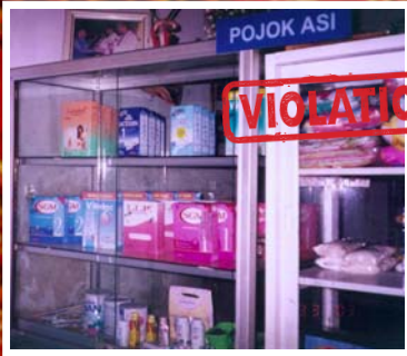
Exhibiting samples of formula in hospitals is forbidden by the Code

A survey of the state of the International Code of Marketing of Breastmilk Substitutes and subsequent WHA Resolutions