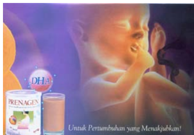
Trying to create ever-expanding markets: reaching out to pregnant mothers ... Promotion of milks for pregnant women and lactating mothers undermines mother's confidence in her ability to breastfeed

Apart from blatant Code violations, also worrying is the way companies 'stretch' the rules. This is mainly done by promoting growing-up milk and milk for mothers. These are relatively new products and therefore not covered by the Code or Indonesian regulations. Companies know that marketing products with similar brand names as formula promotes brand recognition, for example SGM 3 by Sari Husada bears nearly the same brand name and logo as SGM 1 and SGM 2. Promotion of growing-up milks and milks for mothers in the mass media is widespread and should be discouraged.