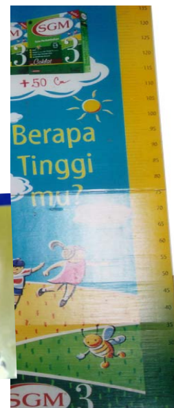
SGM 3 height chart also promotes SGM 1 and SGM 2