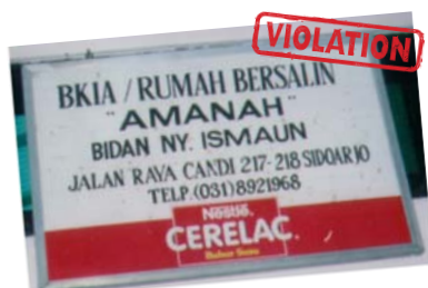
Cerelac sign board for maternity home