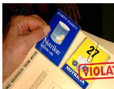
File numbers with advertising messages