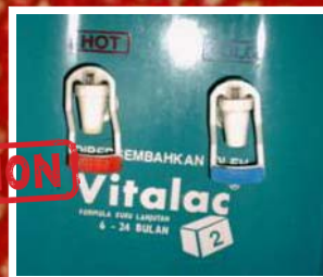
Companies give equipment such as water dispensers so they can advertise in hospitals