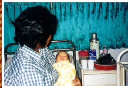
Mother with Lactogen sample – some hospitals give more expensive brands to mothers in first class wards