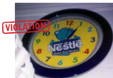
In maternities Nestlé's blue bear tells the time