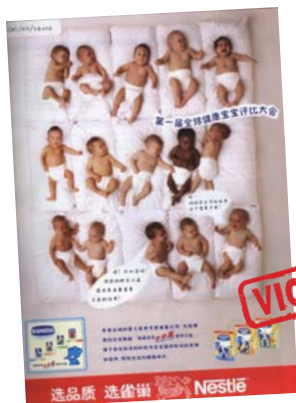
Have you heard? The winners of Global Baby Competition are fed by Nestlé!

The Code's ban on promotion is echoed in the Chinese Rules which prohibit the advertisement or promotion of breastmilk substitutes in the media. Despite this, promotion is widespread in all the cities monitored. Companies promote to the public by distributing leaflets, advertising in magazines and professional journals and going on air with special radio and TV programmes to attract new customers.