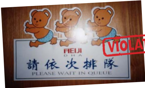
At least three companies distribute bear stickers to hospitals to promote brand recognition. Companies also give supplies of formula to health facilities on a regular basis to ensure a captive market.