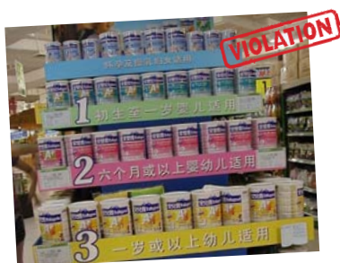
(Left) In a supermarket in Guangzhou, Mead Johnson shows its formula series in a special display. (Right) In another supermarket, the duty roster for Mead Johnson representatives is found on a shelf

Shops and supermarkets in China are flooded with a full range of breastmilk substitutes and are favoured points of contact with mothers. Companies often send their promoters to these retail outlets to conduct innovative promotional programmes.