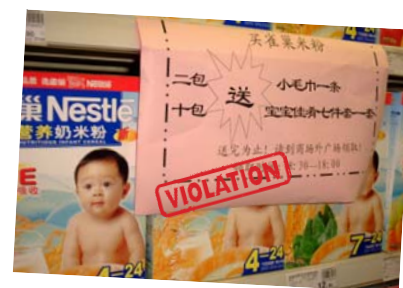
Free gifts with purchase of Nestlé products