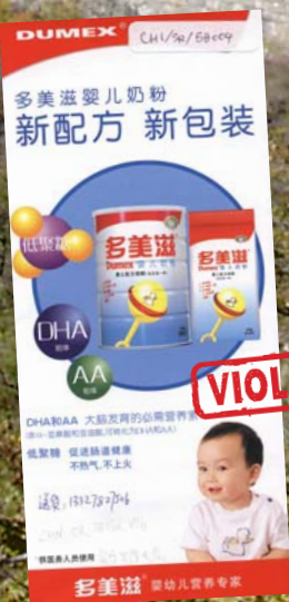
Dumex: dubious claims on DHA and "it is not 'heaty'!"