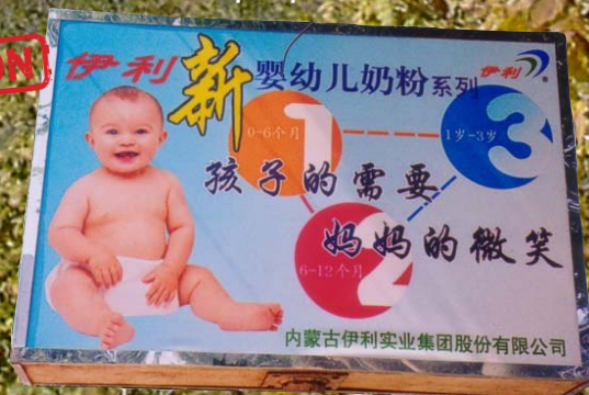
Billboard in Inner Mongolia advertising Yi Li infant formula