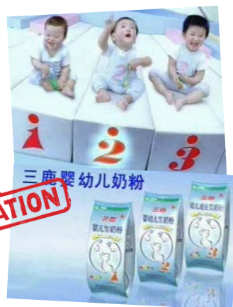
TV ad promotes a whole range of milks, which includes infant and follow-up formula from Sanlu