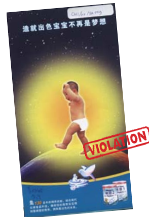
Nestlé: use NAN and "Raising an excellent child is no longer a dream"