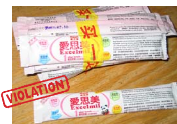
Free samples for mothers from Maail, no purchase necessary – yet.