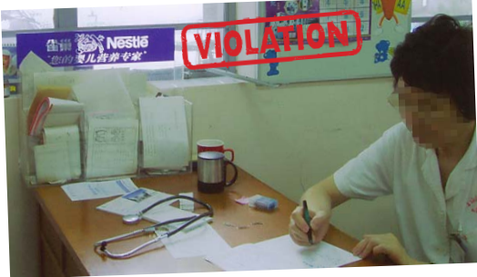
No brand names are mentioned but medical endorsement of Nestlé's products is implicit

Some health care facilities stand firm in refusing any company materials, preferring to produce their own materials on infant and young child feeding. Other hospitals and clinics do not seem to be aware of the legal and ethical implications of openly displaying billboards, posters and promotional materials from baby food companies.