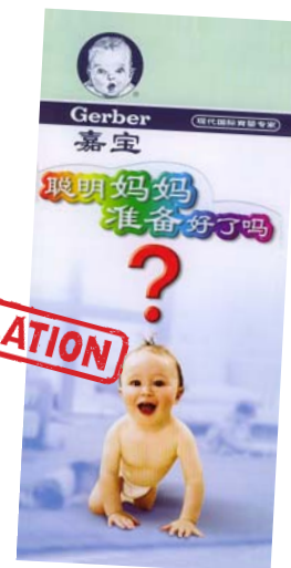
Gerber: "Smart mother, have you prepared well?"

Shops and supermarkets in China are flooded with a full range of breastmilk substitutes and are favoured points of contact with mothers. Companies often send their promoters to these retail outlets to conduct innovative promotional programmes.