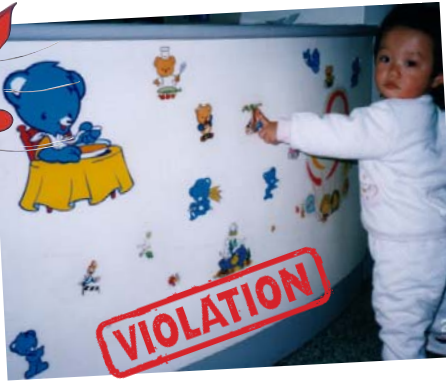
Nestlé's "blue bear" in maternities represents complementary food and encourages early weaning