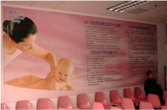
Commercial messages – in this "Three Tens" billboard, a Johnson & Johnson picture takes up half the space. Other companies also sponsor such "Three Tens" posters in baby-friendly hospitals.

Health care facilities are becoming increasingly dependent on baby food companies to carry out some of their services and activities. For example, many of the posters displaying the "Three Tens" (10 points of the International Code, 10 steps to successful breastfeeding & 10 points of the hospital's management policy) and other materials on infant feeding and child care are funded by companies.