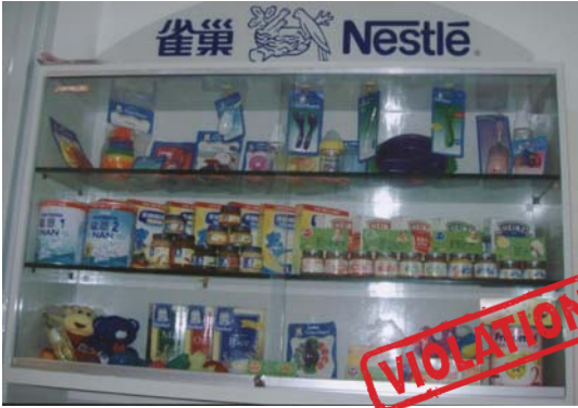
The display of products in health care facilities is not allowed