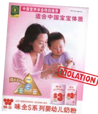
Leaflet by Wei Chuan says its products are recommended by a health authority and a nutrition association