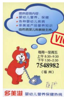
Want to know more about infant nutrition and child illness? Just ask Dumex!