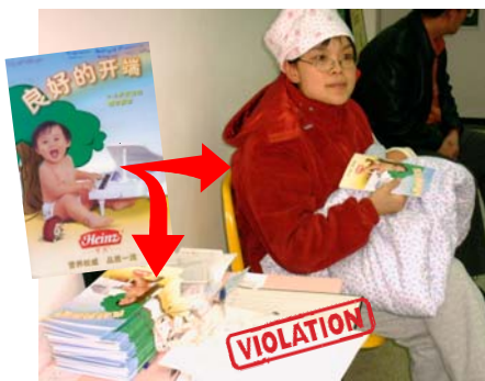
To encourage early complementary feeding, a whole pile of Heinz booklets are available to mothers in the waiting room of a neonatal clinic

Other forms of violations found in HCFs include the distribution to mothers of information and educational materials meant for health workers. Companies readily supply bulk copies to ensure they 'trickle down' to mothers. Most are promotional in nature and entice mothers to purchase their products. Some companies resort to obtaining medical endorsement from renowned health professionals and their associations to boost the corporate image and consequently the sales volume of their products.