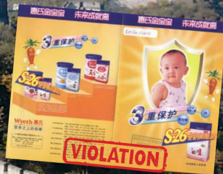
"Wyeth Golden Baby will be Excellent in the Future"