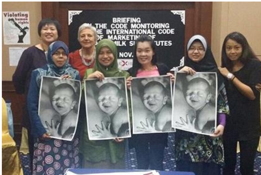
An impromptu "happy baby" moment signifying the commitment towards safeguarding the health of infants.