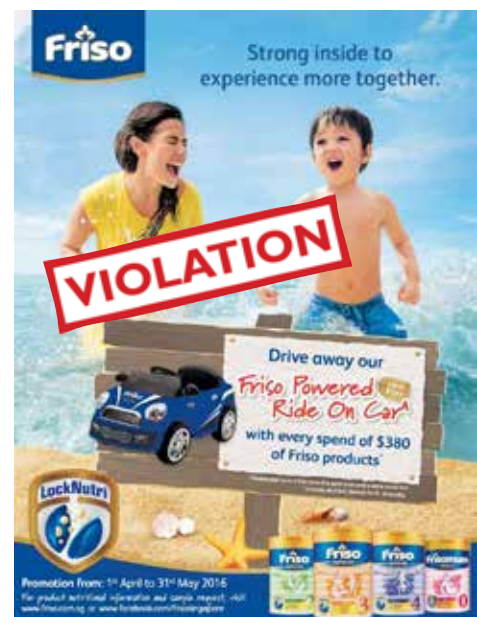
Get a free ride with every purchase of Friesland’s Friso participating products including Friso 3 growing-up milk. (Promotional offer worth S$380 in Singapore).