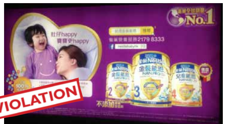
Nestlé says “Happy tummy, happier baby” about their products in the Hong Kong subway terminal.