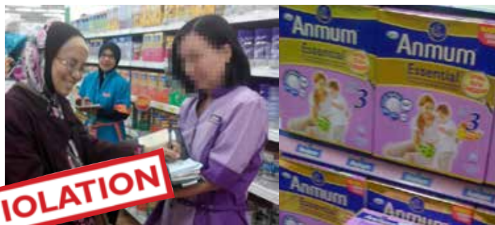
(right) Annum promoter approaching pregnant women for their personal information. Fonterra’s Annum No. 3 milks are heavily promoted in retail outlets in South East Asia.

“Marketing of GUMs may be considered misleading as it creates doubts on the nutritional adequacy of ordinary foods” (EFSA, 2013)